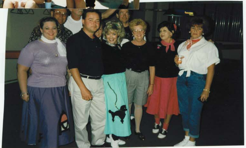
"Back to the 50's" Party = 1996