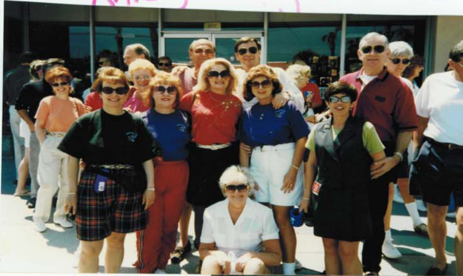
RSC Members Gathering to watch SOS PARADE = 1997