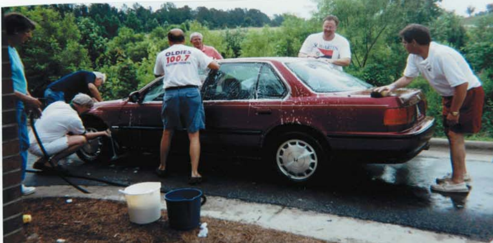
Car Wash Benefit 1998